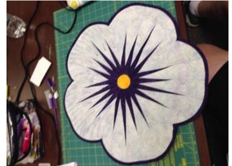
Impatiens Flower Placemat 18" Diameter