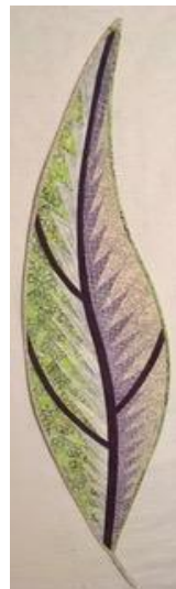
Tea Time Table Runner 13" x 44"