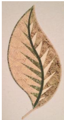
Tea Leaf Placemat 11" x 22"