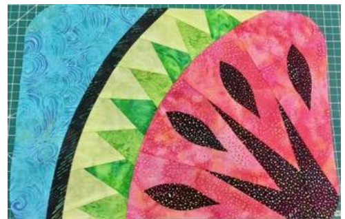
Watermelon Placemat 18" x 13"