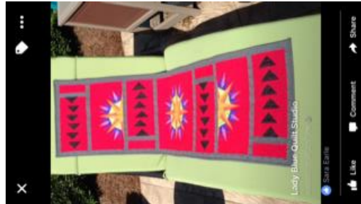
Farmhouse Window Table Runner 19" x 57"