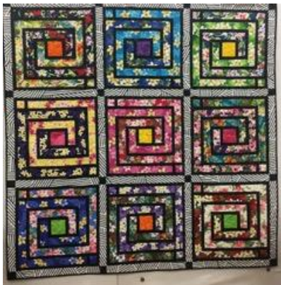
Licorice Rope 67" x 67"